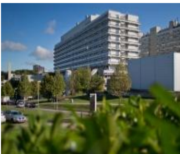
Events All news, press releases, and upcoming events. https://www.uni-stuttgart.de/universitaet/aktuelles/ https://www.uni-stuttgart.de/universitaet/aktuelles/veranstaltung/