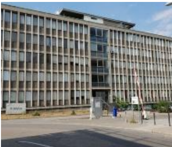
Sprachenzentrum (Language Center) Communicating - Presenting - Writing - Intercultural Competences https://www.sz.uni-stuttgart.de/