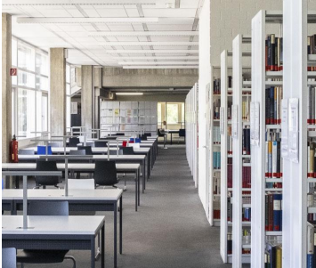
Universitätsbibliothek At Stadtmitte and Vaihingen https://www.ub.uni-stuttgart.de/

Don't forget to take advantage of all the resources the program and the uni have for you!